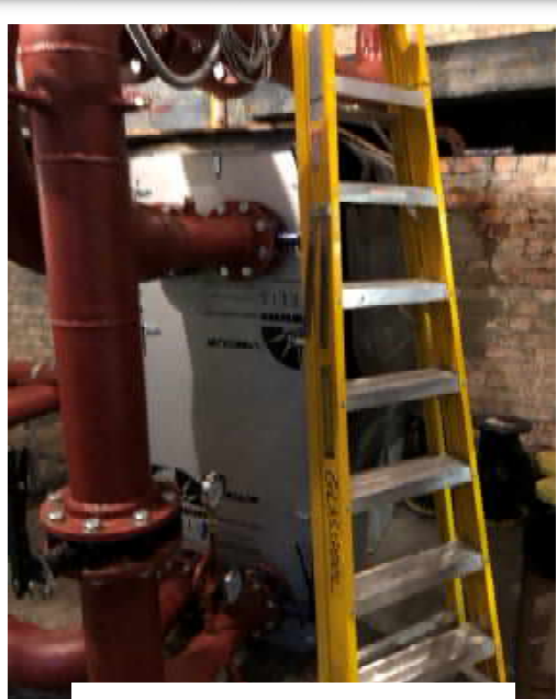
Plate Heat Exchanger Installed